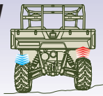
INDEPENDENT REAR SUSPENSION

MODEL YEAR 2010 MODEL YEAR 2010 MODEL YEAR 2010 MODEL YEAR 2010 MODEL YEAR 2010 MODEL YEAR 2010 MODEL YEAR 2010